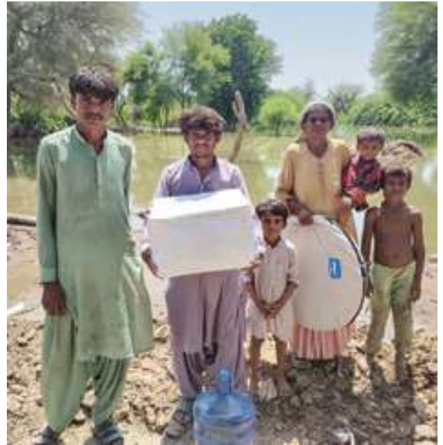
Flooding victims in Pakistan receive emergency aid.