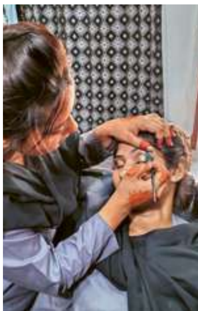
In the safe house the girls learn how to apply make-up. csi