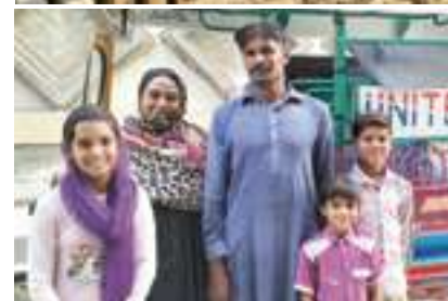
CSI was able to free a number of brick kiln workers and their families from debt slavery. csi