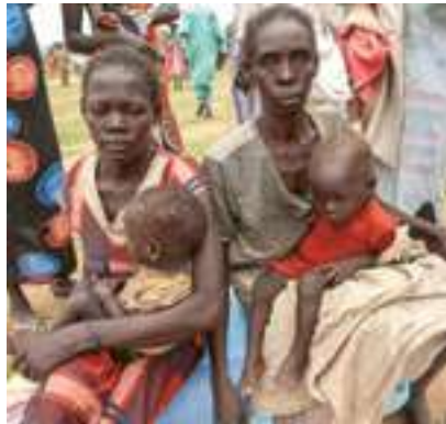
Food aid in South Sudan: mothers wait for a portion of millet. csi